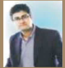
Prasoon Joshi Advertising