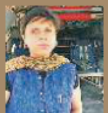
Barkha Dutt TV Journalist