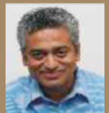
R. Sardesai TV Journalist